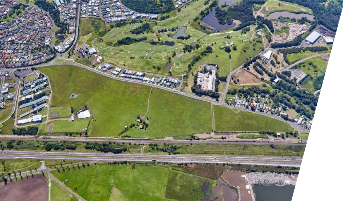
An aerial shot of the preferred site at Dunmore Road